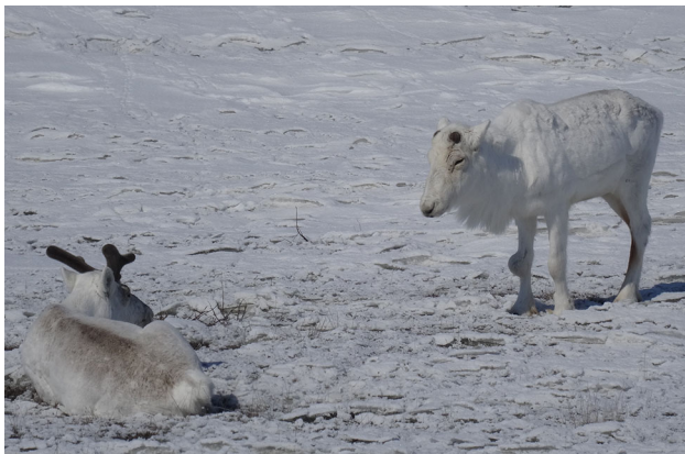
Figure 2. Two caribou of the Dolphin and Union herd photographed on May 08, 2019 on the mainland close to Kent peninsula and adjacent to Victoria Island. The caribou on the right has evident bilateral carpal hygromas—swollen joints—especially severe on the right leg: a typical sign of Brucella suis biovar 4 infection. This caribou, which also appears to have a severe subcutaneous infestation with warble fly larvae on its back, has a noticeable physiological delay for expected seasonal changes, such as growing antlers and shedding winter coat, compared to the caribou on the left, which appeared healthy. (Color figure online).

We did not detect Brucella antibodies in the muskoxen sampled near Sachs Harbour (Banks Island) and Kugluktuk (mainland). However, given the limitations discussed for the interpretation of the serological data and the small sample size for the KU area, we cannot say definitely that brucellosis is absent from those areas. For Banks Island samples, although we cannot exclude that BPAT screening failed to detect Brucella antibodies, we are more confident in our results given a larger sample size and the fact serological testing was paired with veterinary postmortem inspections of carcasses which found no evidence of brucellosis (Elkin B., personal communication). On Banks